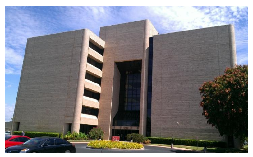
1300 S. Meridian Avenue, Oklahoma City